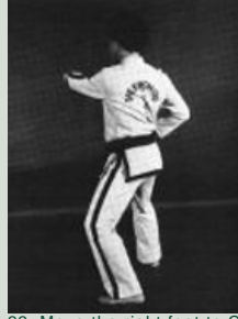
22. Move the right foot to C forming a left L-stance toward C while executing a middle punch to C with the left fist.