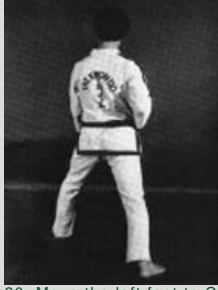
20. Move the left foot to C forming a left walking stance toward C while executing a low block to C with the left forearm.