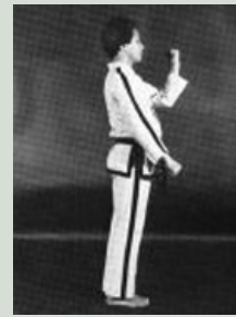
27. Execute a side front block with the left inner forearm, extending the right forearm to the side downward while maintaining a closed stance toward B.