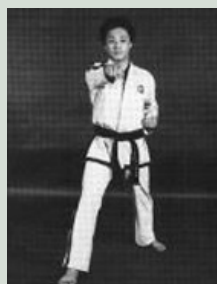
14. Move the right foot to D forming a right walking stance toward D at the same time executing a middle punch to D with the right fist.