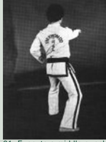
21. Execute a middle punch to C with the right fist while forming a right L-stance toward C, pulling the left foot.