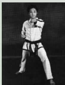
13. Move the left foot to D forming a left walking stance toward D while executing a middle punch to D with the left fist.