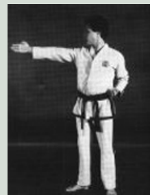
7. Execute a downward strike with the right knife-hand while forming a left vertical stance toward A, pulling the right foot.