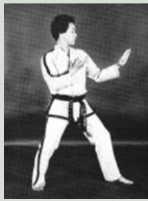
17. Move the right foot on line EF forming a right L-stance toward F while executing a middle guarding block to F with a knife-hand.