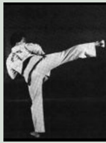
18. Execute a high turning kick to DF with the right foot and then lower it to F.