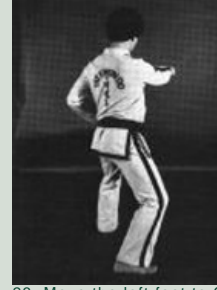
23. Move the left foot to C forming a right L-stance toward C while executing a middle punch to C with the right fist.