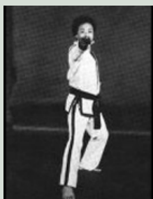
12. Execute a middle side piercing kick to D with the right foot while pulling both hands in the opposite direction and then lower it to D forming a left L-stance toward D, at the same time executing a middle outward strike to D with the right knife-hand.