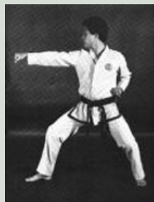
6. Execute a middle punch to A with the right fist while forming a right fixed stance toward A in a sliding motion.