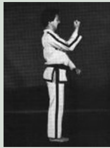
26. Bring the left foot to the right foot, turning counter clockwise to form a closed stance toward B while executing a side front block with the right inner forearm while extending the left forearm to the side downward.