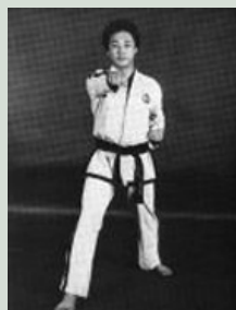
10. Move the right foot to D forming a right walking stance toward D while executing a middle punch to D with the right fist.