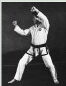
4. Execute a twin forearm block while forming a left L-stance toward A, pivoting with the left foot.