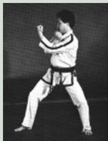
5. Execute an upward punch with the left fist while pulling the right side fist in front of the left shoulder, maintaining a left L-stance toward A.