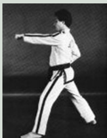
8. Move the left foot to A forming a left walking stance toward A while executing a middle punch to A with the left fist.