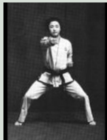
2. Execute a middle punch to D with the right fist while maintaining a sitting stance toward D.