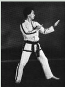
28. Move the left foot to B forming a right L-stance toward B at the same time executing a middle guarding block to B with a knife-hand.