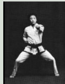
3. Execute a middle punch to D with the left fist while maintaining a sitting stance toward D.