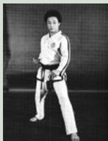
9. Move the left foot to D forming a left walking stance toward D while executing a low block to D with the left forearm.