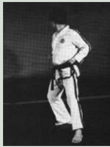
25. Move the right foot to C in a sliding motion forming a right L-stance toward D while thrusting to C with the right side elbow.