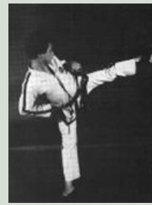
19. Execute a high turning kick to CF with the left foot and then lower it to F forming a right L-stance toward F while executing a middle guarding block to F with a knife-hand. Perform 18 and 19 in a fast motion.