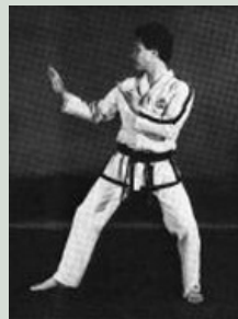
29. Bring the left foot to the right foot and then move the right foot to A forming a left L-stance toward A while executing a middle guarding block to A with a knife-hand.