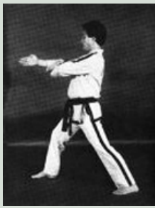
16. Move the right foot to E forming a right walking stance toward E while executing a middle thrust to E with the right straight finger tip.