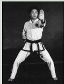
1. Move the left foot to B to form a sitting stance toward D while executing a middle pushing block to D with the left palm.