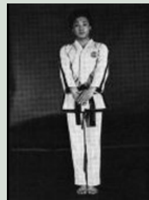
END: Bring the right foot back to a ready posture.