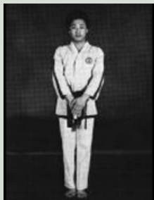
Closed ready stance C toward D.