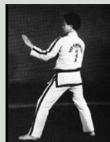
15. Move the left foot to E forming a right L-stance toward E while executing a middle guarding block to E with a knife-hand.