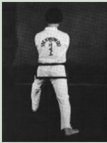
24. Execute a pressing block with an X-fist while forming a left walking stance toward C, slipping the left foot to C.